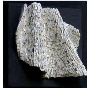
Remnant 11" x 11" Orsoni smalti, marble

Please contact me to be included on the Tesserae mailing list, and indicate your preference to receive it free via email or through the US Postal Service for only $5. a year. Please include comments about this first issue and what you would like to see in future ones. Your input will help make this more informative.